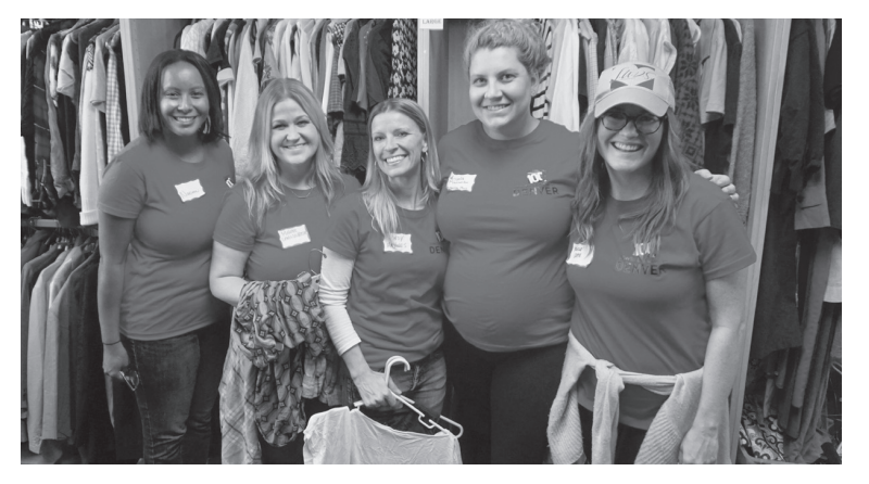
JLD members volunteer at The Gathering Place during L.U.V.S. day of service