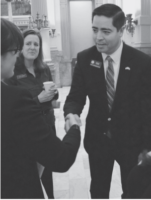
JLD member and legislator meet at Legislative Breakfast