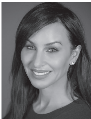
Molly Bloom, entrepreneur and author of Molly's Game, to keynote The Journey

to present voluntarily and without expecting compensation.