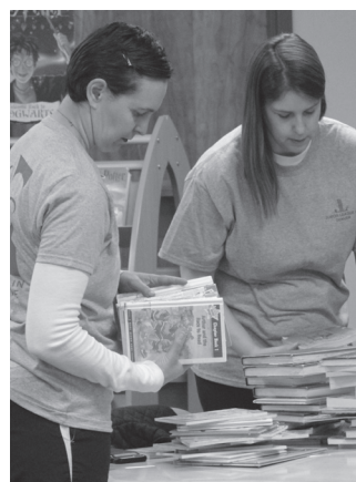
Above: Organizing the library at Swansea Elementary

Community Council would love your feedback on L.U.V.S.! Each year, L.U.V.S. will choose a new focus — be it a neighborhood, a school system, or another need in the Denver community. We are open to hearing where you believe the League can improve its community. Email your thoughts to: jldluvs@jld.org .