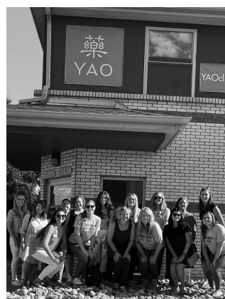
Board members stopped by our new building, located at 1301 S. Washington St., during the retreat!

In March 2022, a promising building was identified that checked all parameters voted on by membership for the next JLD Headquarters. This includes multiple reception areas, fully accessible meeting space and a kitchen area on the main level, office and storage space, and sufficient parking, all while still being in a location that is conveniently located for members and guests. JLD provided an all-cash offer, giving us the advantage of going through a swift negotiation, due diligence process, and successful close. Ultimately, the ability to close quickly was a key point in our negotiations and allowed the League to secure the property for less than the listed price. Construction has begun to renovate the interior to meet the League's specific needs. A special thank you to the Building Committee for their tireless work to make this possible. We are thrilled to move into our new home in early 2023! Questions? Email building@jld.org .