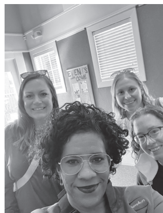
DEIB Field Trip to Colorado Center for Women’s History on April 1

The Diversity, Equity, Inclusion & Belonging Committee hosts monthly media club events where they discuss articles, podcasts, books and more in order to meet more learning styles. Each month, they pick a different theme and select resources to listen, watch and read. All are welcome, even if members don’t have time to review the materials. They are encouraged to join, listen, learn and discuss. In March, the committee focused on celebrating Women’s History Month with resources including the 10-part podcast “AmplifyHER” from the United Nations, the TV series “Women of the Movement,” and literature by Chimamanda Ngozi Adichie. The April DEIB Media Club will focus on Autism Awareness Month . The format and type of resources change each month — even including two field trips in April. All members are invited to join in!