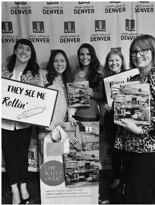
Members celebrate our newest cookbook, “Centennial Celebrations”

Thank you to the Cookbook Committee for all your hard work you continue to put into making Centennial Celebrations a success. And look for more cookbook events in the future!