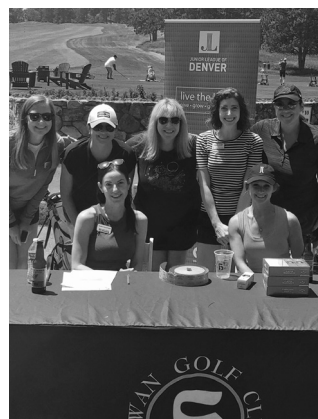
Inaugural Drive for Change Golf Tournament

Members receive special pricing for the JLD's six award-winning cookbooks. Please call 303.692.0270 (press zero) or email info@jld.org if you would like to place an order and arrange a curbside or after-hours pick-up at the office. Colorado Cache is $15 and the other five books are $20. Prices include tax.