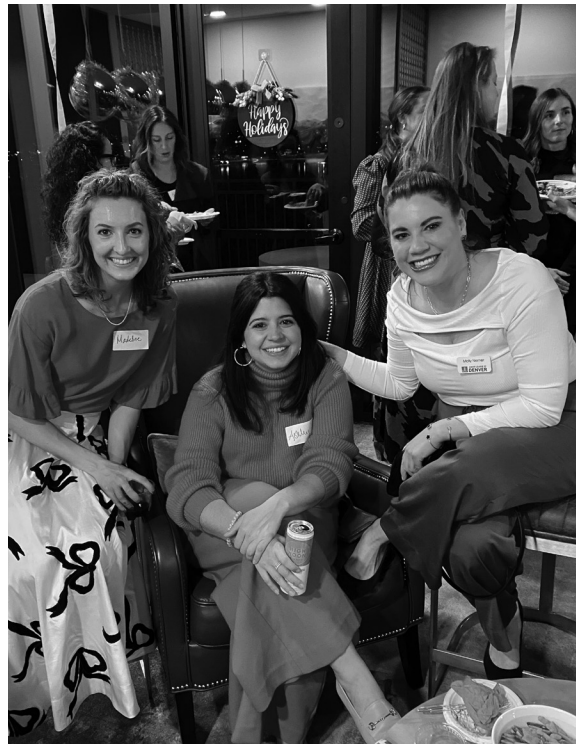
New Member Holiday Event

Several recruitment events have been planned. These include virtual informational sessions, in-person coffees and happy hours. These wonderful opportunities for women curious about the League to find out more. Encourage the women in your life to visit JLD.org/join to sign up. Questions? Email join@jld.org .