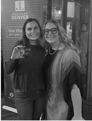
End of Year GM