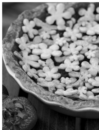
Bring on Spring with delicious fruit pie

to present voluntarily and without expecting compensation.