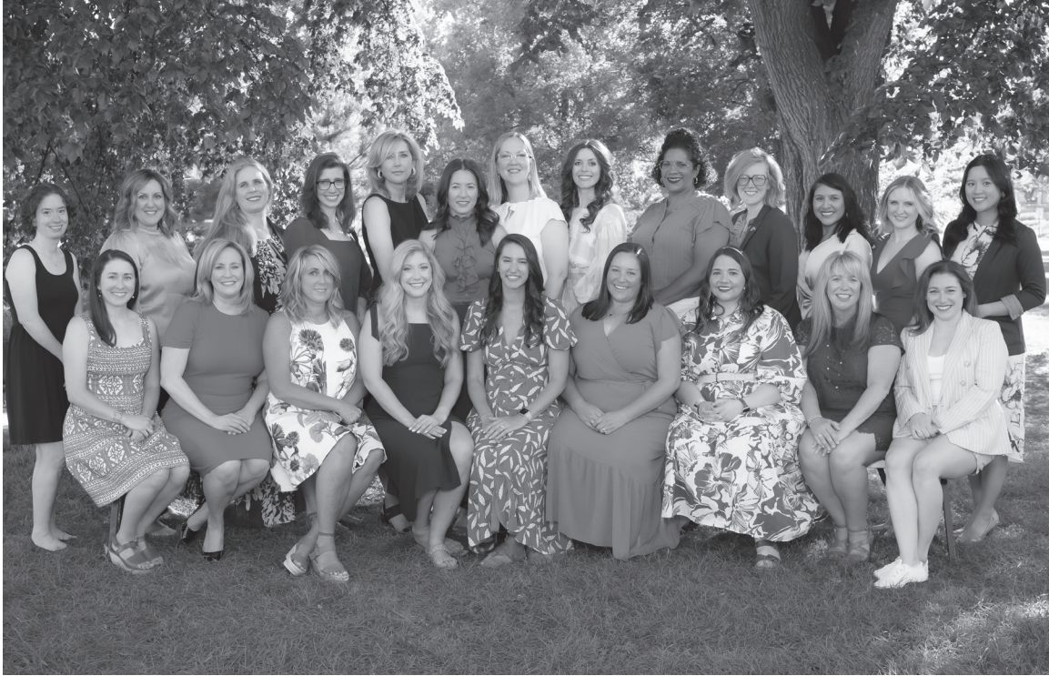
2023–24 Board of Directors & Advisory Board