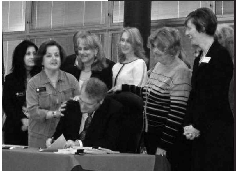
Governor Bill Ritter signed SB123: Healthy Schools Dropout Prevention into law on May 21, 2009.