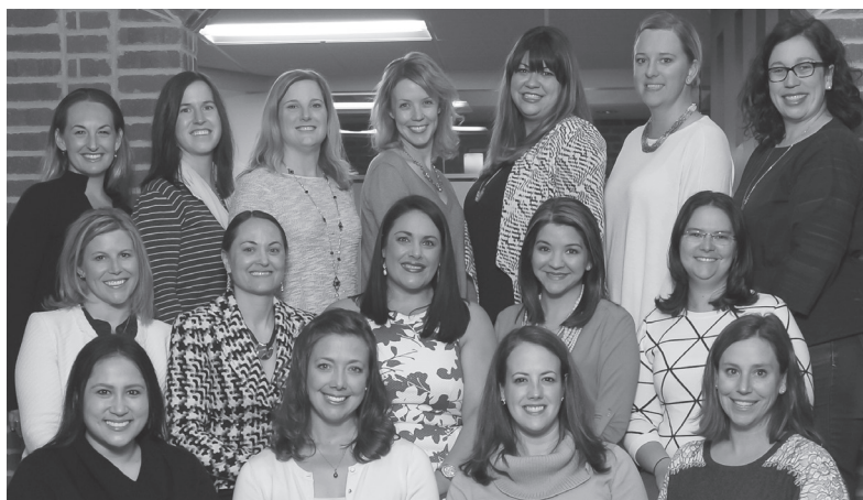
2015–2016 Board of Directors