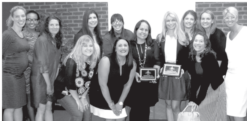
Public Policy Council and Legislators of the Year