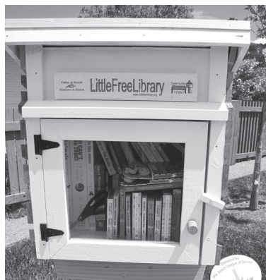
Braille Little Free Library

A JLD member and our Community Council recently created, stocked and donated a Little Free Library to the Anchor Center for Blind Children. The grand opening and dedication of this very special braille library to benefit visually impaired children birth to five years took place on Thursday, May 19.