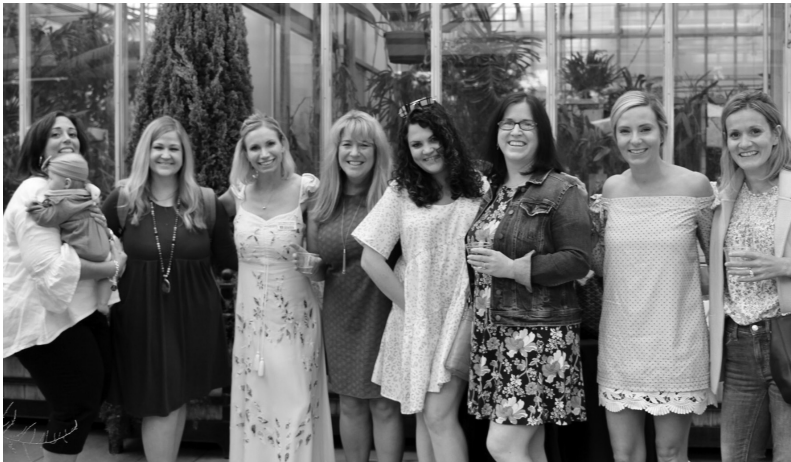
Members enjoyed spending time together in-person!