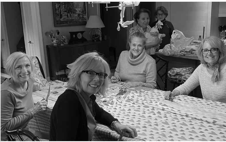
Fun Club participates in The Blanket Project