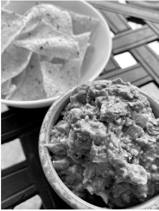
Fast and Fresh Guacamole

to present voluntarily and without expecting compensation.