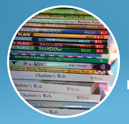
$5K supplies 2,000 books to our signature Read2Kids program