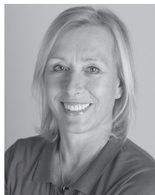
Martina Navratilova, Keynote Speaker

A heartfelt thank you goes out to all who donated to the JLD Foundation on Colorado Gives Day, Tuesday, December 9th! Because of your generosity, we raised nearly $17,000 from 163 donors , surpassing our total from last year. Questions? Email foundation@jld.org